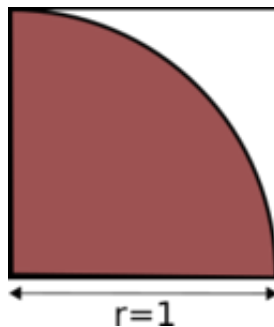
Figure 2: Computing \pi .

We illustrate parallel computation in UPC++ with a simple program that does a Monte Carlo calculation of \pi . This contrived example was chosen because it provides a clear illustration of some of the properties of parallel computation, and has a known correct answer, so we can check our implementation. The value of \pi can be calculated by repeatedly choosing a random point within the unit square, and counting the percentage of points that fall within the unit circle quadrant (see figure 2). For a unit square with r=1 , the area of the circle quadrant is \pi \cdot r \cdot r / 4 = \pi / 4 . A point x,y is inside the circle if x \cdot x + y \cdot y < 1 . So we can compute the ratio of the number of points inside the circle, p_{in} , to the total number of points, p_{tot} , in order to estimate \pi , i.e. \pi = 4 \cdot p_{in} / p_{tot} .